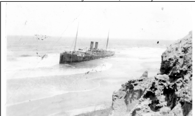
The Maheno 1935. This photograph was taken soon after this 52 ton luxury liner washed ashore in a July storm (not dissimilar to the severe storm in early March, 2006 which was judged to be the equivalent of a Force 2 cyclone). He Maheno is now a dangerous rusting hulk on the beach

Water Extraction: The other big issue to re-establish this coalition has been the proposal to proclaim Fraser Island as a Wild River. This would remove forever the option to exploit Fraser Island's Bogimbah Creek. For decades the City of Hervey Bay has eyed Fraser Island's environmental water flow as an option for a future urban water supply, particularly Bogimbah which has the strongest flow of the lot and which is conveniently placed for Hervey Bay City. These water miners regard water running to the sea as a waste. They have failed to see that without this environmental flow of fresh water and nutrients into Hervey Bay the salinity and pH of the bay will be affected. Fish are extremely sensitive to these factors and with the cessation of flow from the Mary and Burnett Rivers due to the construction of new dams and weirs on those two major streams, it is only flow from