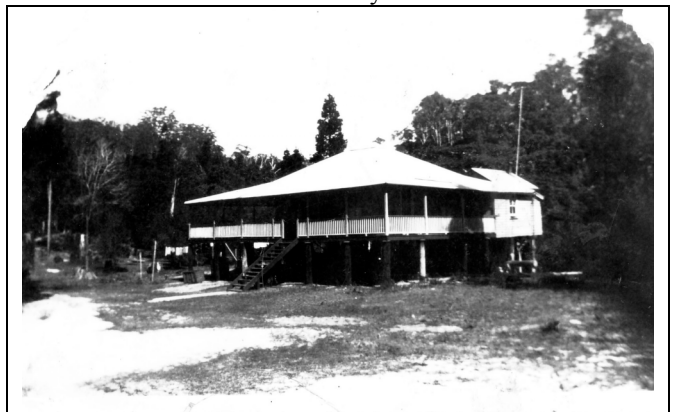
The former District Forester's Central Station house at Central Station (circa 1920). It was noted for its very wide verandahs. The verandahs were removed when it was relocated later to Ungowa.

Fish which develop within "no-take" zones spillover to augment populations outside reserves. Animals are most abundant inside reserves and just across their boundaries. This has been established at several marine reserves around the world. Moreover, fishing boats often congregate along the borders of marine reserves, because that is where catches are highest. This practice of "fishing the line" can be observed at many marine reserves.