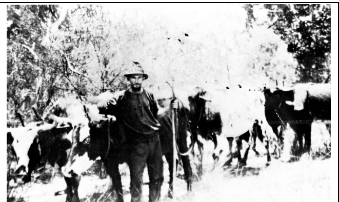
Gone are the days of the bullock teams on Fraser Island. This was taken near Figtree Lake about 1905. Just as the transport of timber using bullocks was replaced, FIDO believes better transporting Fraser Island visitors is now overdue.

The Beattie Government now has to determine how it will respond to opposition to conservation measures which will benefit the whole of the Great Sandy Region. Will they be like the Bjelke-Petersen Government which for decades took the side of the anti-conservation coalition or will they take the enlightened view and realize that positive steps now will sustain the marine environment of Hervey Bay for future generations and take the necessary steps to create adequate "no-take" zones which will increase the productivity of the Hervey Bay fishery indefinitely.